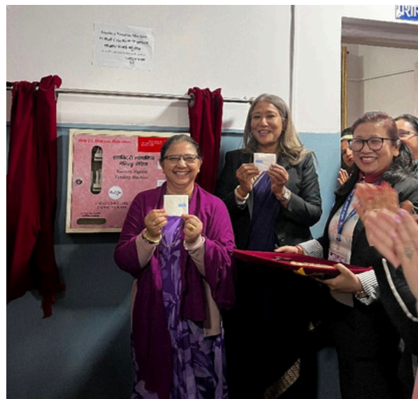
The Supreme Court of Nepal, International Women's Day 2025

By placing essential products in key public spaces, Pad2Go continues to challenge taboos, advance equitable access, and advocate for the inclusion of menstruators across public and professional spaces.